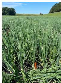
Low threshold + fungicide