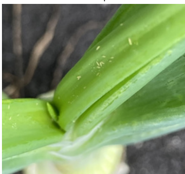
Onion thrips larvae