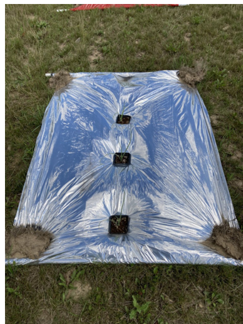
Photo of mulch experiment.

Gray, red, and black mulches had lower thrips numbers than silver and white mulches.