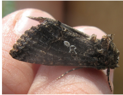
FIG. 6. Cabbage looper adults are about an inch long, with wings folded over the back at rest. Adults are dark brown moths with a distinct figure “8” white pattern in the middle of the wings.

Diadegma insulare is another small parasitic wasp that attacks diamondback moths. They also develop inside their caterpillar hosts, and the adults emerge from the diamondback moth pupae. The caterpillar can feed and develop, but it cannot become an adult, and it cannot go on to reproduce.