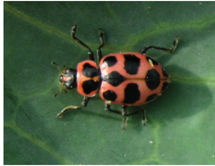
FIG. 9. Pink-spotted lady beetle adult is a predator commonly found in Michigan cole crop fields. These insects feed on the eggs and small larvae of cabbage pests.

Novaluron and methoxyfenozide are both insect growth regulators: they stop insects from developing through their normal life stages. These insecticides are more effective on small caterpillars. Methoxyfenozide has a one-day and novaluron a seven-day preharvest interval. Broad-spectrum insecticides are also available for use in cole crops. Many of these are applied to control other pests but will also be effective against caterpillars.