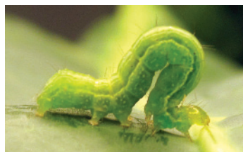
FIG. 5. The cabbage looper caterpillar is a pale green insect with a white stripe down each side of the body. The cabbage looper reaches 1 to 1 1/2 inches in length and has a distinctive pale green head capsule. It gets its name from its inchworm motion as it moves along the surface of the leaf.