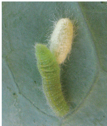
FIG. 8. White parasitoid pupa attached to its imported cabbageworm caterpillar host.

Tachinid flies, such as Voria ruralis and Compsilura concinnata , are common parasitoids of the cabbage looper. As in the case of the Diadegma insulare , the caterpillar can feed and develop, but it cannot become an adult, and it cannot go on to reproduce.