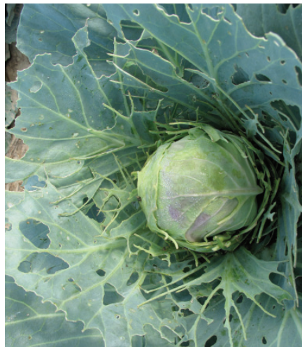
FIG. 7. Caterpillar damage on cabbage: holes chewed into the leaves and head.