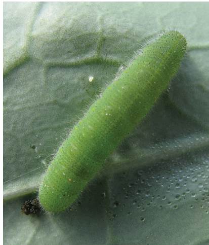
FIG. 1. The body of the imported cabbageworm caterpillar is covered with fine hairs, which give it a velvety look. The color of the caterpillar matches that of the leaf; when scouting, look for signs of fresh damage and frass on the plants. A closer look will reveal the caterpillar feeding on the leaf.

Imported cabbageworm. Eggs are yellow and conical, laid individually on the leaf surface and occasionally on the stem. An adult butterfly can lay 300 to 400 eggs in her lifetime. The imported cabbageworm caterpillar is dark green with fine hairs covering the body, which create a velvety appearance (Figure 1). Large larvae begin to develop a yellow stripe on the upper surface of the body, which is clearly visible on the final larval developmental stage. Maximum length for the imported cabbageworm is approximately 1 inch. This caterpillar is commonly found along the veins of leaves and easily blends into the foliage. As an adult, the imported cabbageworm is a white butterfly with black markings on the wing tips. The adult is commonly referred to as the cabbage white butterfly (Figure 2).