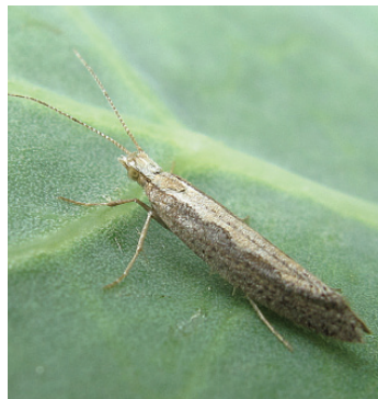
FIG. 4. The adult diamondback moth is a small (1/2 inch) brown insect, with characteristic diamond-shaped markings on the wings, visible when they are folded over the back at rest.