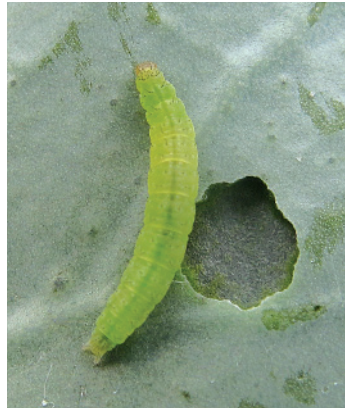
FIG. 3. The larva of the diamondback moth is light green and segmented with tapering ends. The caterpillar spends its life feeding on the leaf.

Cabbage loopers. Cabbage loopers migrate northward on wind currents from southern states, so they often arrive in Michigan later in the growing season. Larvae emerge from eggs within a few days and develop for 16 to 19 days before pupating. The pupa turns from initially green to dark brown, and the adult emerges 9 to 10 days later. The entire life cycle lasts 32 to 37 days, allowing for one to two generations to develop in a typical Michigan season.