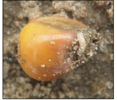
Figure 3. Seedcorn maggot on a damaged corn seed. If you notice a stand reduction in corn or peas, dig up seeds to determine if seedcorn maggot is the culprit.

Unlike beans, damage in peas, sweet corn, and vine crops is typically not visible above ground, and is noticed as a stand reduction. Dig up seeds where there is a gap in the stand and split them open to look for maggots and tunnels.