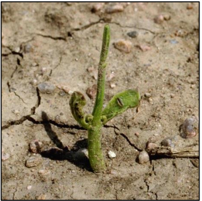
Figure 2. Seedcorn maggot damage in beans is often noticed once seedlings emerge. This seedling had its leaves removed before emergence.

areas on the cotyledons, and in severe cases a "snakehead" symptom when the growing point is completely destroyed and seedlings emerge leafless. Stand reduction in beans may be less common than in other crops, but damaged plants may be slow to develop and unproductive.